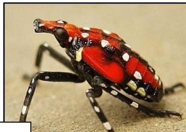
Fourth Instar Nymph Spotted Lanternfly.