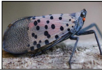
Adult Spotted Lanternfly.