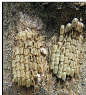
Spotted Lanternfly Egg Mass.