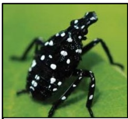
Early Nymph Spotted Lanternfly.