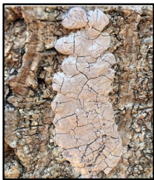
Spotted Lanternfly Unhatched Egg Mass.