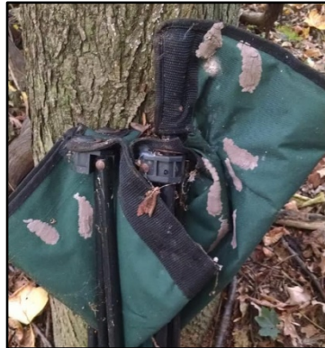
Spotted Lanternfly Egg masses on Camping Equipment.