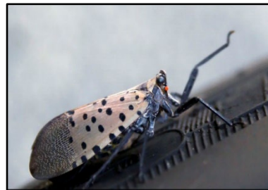
Adult Spotted Lanternfly on Vehicle Tire.