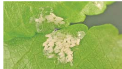
Fig. 3 – Diaprepes eggs on unfolded leaves