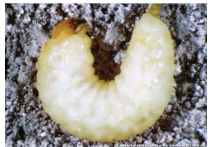
Fig. 4 – Full grown Diaprepes larva