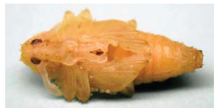
Fig. 5 – Pupal stage of Diaprepes