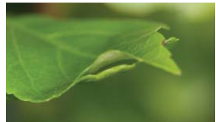
Fig. 2 – Leaves folded and glued together