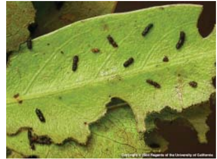
Fig. 1 – Frass left by feeding adults

Read UC Publication 8131: Diaprepes Root Weevil (free) found on the University of California Division of Agriculture and Natural Resources publications website: http://anrcatalog.ucdavis.edu . Detailed information on the quarantine boundaries can be found on the California Department of Food and Agriculture PHPPS Regulations Activities website: http://pi.cdfa.ca.gov/pqm/manual/htm/417.htm