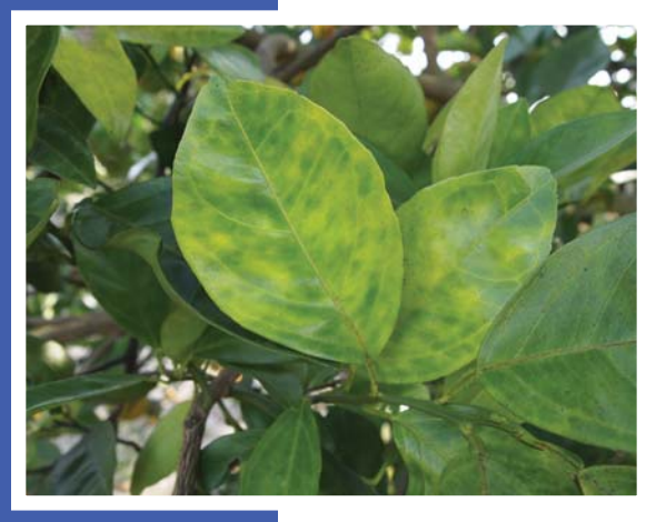
HLB leaf symptoms can produce unique yellow mottling which is not the same on both sides of the leaf.