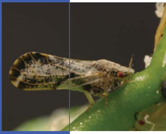
Adult Asian citrus psyllid – 1/8th of an inch long