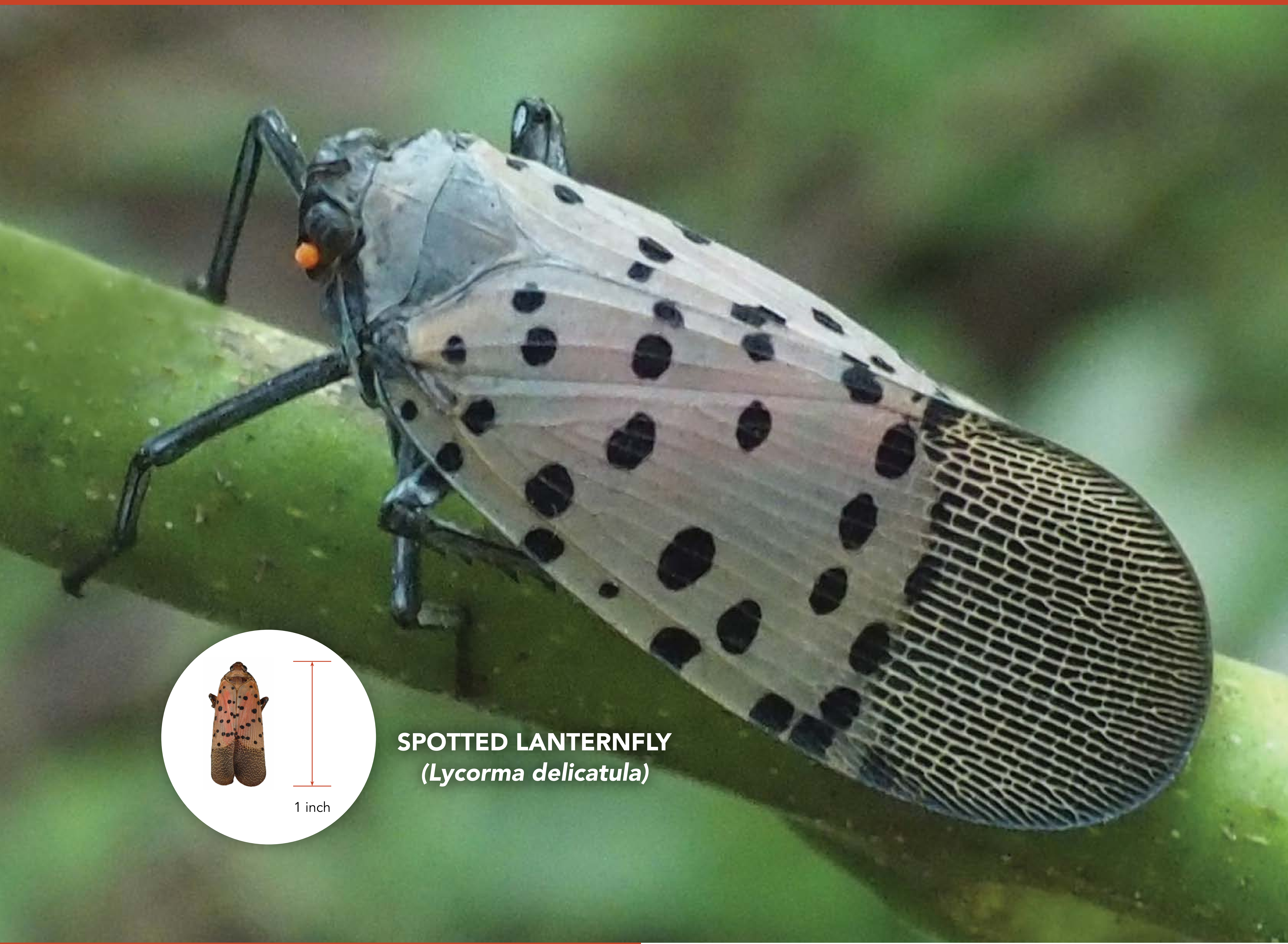
SPOTTED LANTERNFLY ( Lycorma delicatula )