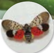
Adult Summer - Winter