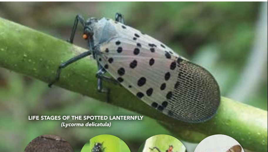
LIFE STAGES OF THE SPOTTED LANTERNFLY ( Lycorma delicatula )