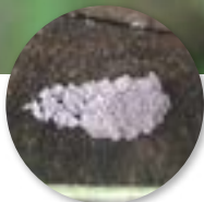
Egg Mass Year-round