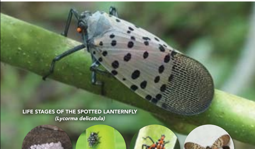
LIFE STAGES OF THE SPOTTED LANTERNFLY ( Lycorma delicatula )