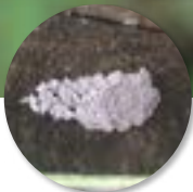
Egg Mass Year-round