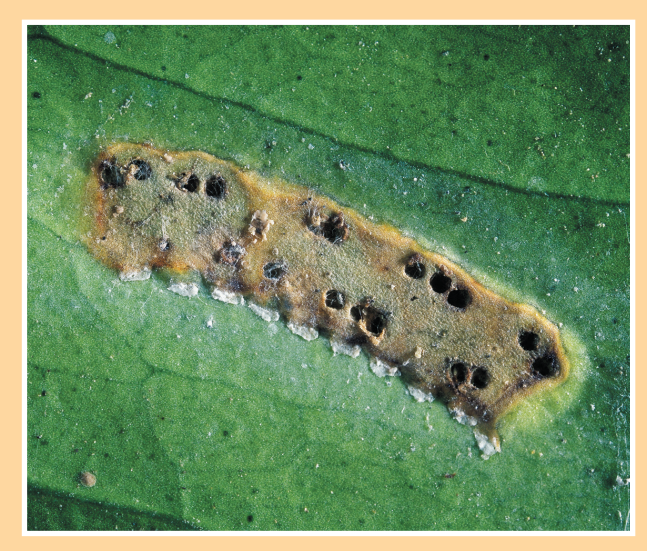
Parasitized egg masses are tan to brown with small, circular holes at one end of the eggs.

Glassy-winged sharpshooter eggs are laid together on the underside of leaves, usually in groups of 10 to 12. The egg masses appear as small, greenish blisters. These blisters are easier to observe after the eggs hatch, when they appear as tan to brown scars on the leaves.