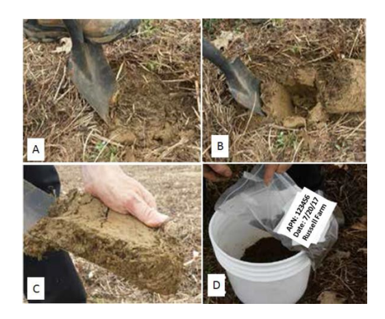
Figure 4. Taking samples with a shovel.