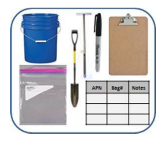
Figure 1. Materials needed for soil sampling.