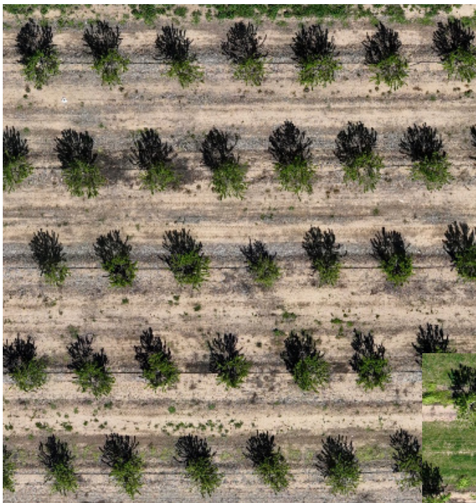
Aerial photos of orchards with and without cover crops.

Interface Expert Convenings: Cover Crops Impact on Water Budgets." These events brought together a diverse group of stakeholders, including university, state, and federal government scientists; university extensionists; local technical assistance providers; conservation organizations; industry representatives; growers; state agencies; and others (refer to Appendix A for a comprehensive participant list). The convening series was designed as an action-oriented forum to build collective knowledge across sectors, share emerging research and observations, and formulate evidence-based recommendations. A key outcome of this series was the joint development of this report by an interdisciplinary team of over 30 experts.