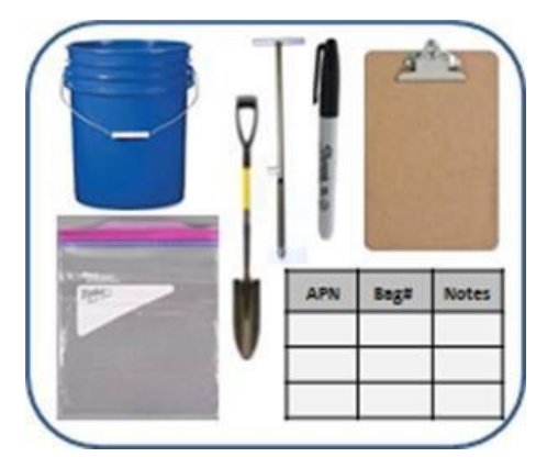
Figure 1. Materials needed for soil sampling.