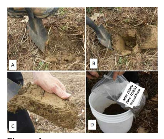
Figure 4. Taking samples with a shovel.

6. Gently mix soils in the bucket and collect 6 cups of well-mixed soils (or no less than 1 lb.) into the sample bag labeled with the APN, sampling date, and farm name (D).