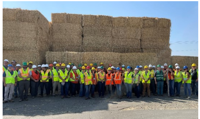
BITS group photo.

The seminar included presentations on topics such as safety, professionalism, biosecurity, and labeling, as well as tours of Wilbur-Ellis and Elk Grove Milling to review feed and fertilizer sampling techniques. View the agenda: https://www.aafco.org/wp-content/uploads/2023/09/BITS_Agenda_2023.pdf .