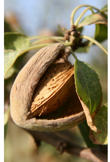
Almond on tree

For more information and resources, please contact the Safe Animal Feed Education Program at safe@cdfa.ca.gov or 916-900-5022, or visit their website at http://www.cdfa.ca.gov/is/ffldrs/safe.html