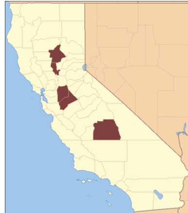
Figure 3: Location of the five leading walnut producing counties in California [6Error! Reference source not found.]

Most walnuts are now produced in the San Joaquin and Sacramento Valleys, with more than half of the acreage being located in San Joaquin, Stanislaus, Tulare, Butte, and Sutter Counties (Figure 2). California growers produce 99 percent of the commercial U.S. supply, with Oregon and Washington accounting for the remaining production [1, 2] . About a third of the crop is exported [3] . California walnuts account for three-quarters of world trade [2] . The most important variety is Chandler, which is planted on about 37% of the bearing acreage. Other important varieties include Hartley (17%) and Howard (9%) [7] . Chandler is a UC Davis selection which became popular in the 1980. Hartley was selected by William Hunter in the late 19 th century and was previously the dominant variety planted in California [1] .