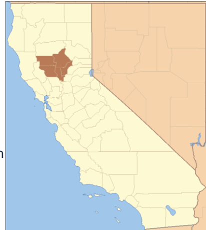
Figure 2: Location of the five leading rice producing counties in California [3].

In the Sacramento Valley, rice is grown on soils with a high clay content or a restrictive layer, which reduce water infiltration. These soils are ideal for rice production, but less favorable for other crops. Rice production in the San Joaquin Valley is small mainly because crops which return a higher income per acre can be grown on the more fertile soils there. In addition, the water supply is more restricted in the San Joaquin Valley compared to the Sacramento Valley [5].