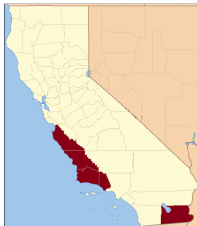
Figure 2: Top celery-producing counties of California in 2012 [6] .

Celery is grown along the southern and central coasts, with some acreage in the southern California desert valleys (Figure 2). Ventura and Monterey are the leading celery producing counties, accounting for almost 80% of California production in 2012. Santa Barbara, San Luis Obispo and Imperial counties also have some acreage [7] .