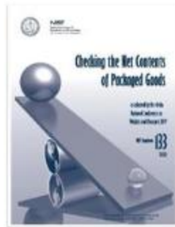
NIST Handbook 133

2025 edition of NIST Handbook 133 , Checking the Net Contents of Packaged Goods . Follow these links for the latest edits related to NIST Handbook 133: