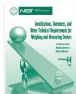
NIST Handbook 44

2025 edition of NIST Handbook 44 , Specifications, Tolerances, and Other Technical Requirements for Weighing and Measuring Devices . Follow these links for the latest edits related to NIST Handbook 44: