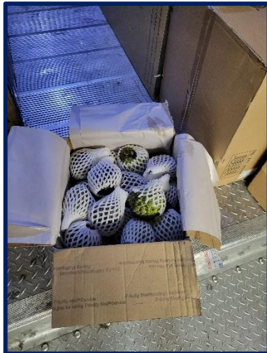
Confiscated commercial shipment of infested Annona squamosa .

Dysmicoccus texensis is a mealybug that is often found feeding on plant roots, where large populations prevent water and nutrient absorption, weaken plants, and reduce crop yields. Dysmicoccus texensis has never been found in the environment in California. Its entry to the state is likely to have significant economic and environmental impacts. Dysmicoccus texensis was intercepted 44 times by CDFA's Border Stations, Dog Team, and High-Risk programs between January 1, 2000 and December 31, 2014. The mealybug has been found on limes, grapefruit, bananas, bell peppers, sugar apple, and aerial parts of unidentified plants.