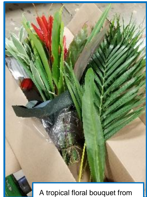
A tropical floral bouquet from Ecuador shipped by The Bouqs.

Pest samples were collected and sent to the PPD Entomology Laboratory where they were identified as the following: