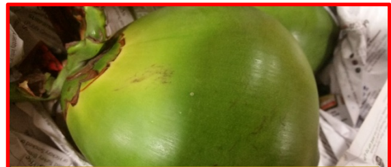
Green coconut fruit from Florida infested with Aonidiella orientalis (oriental scale)