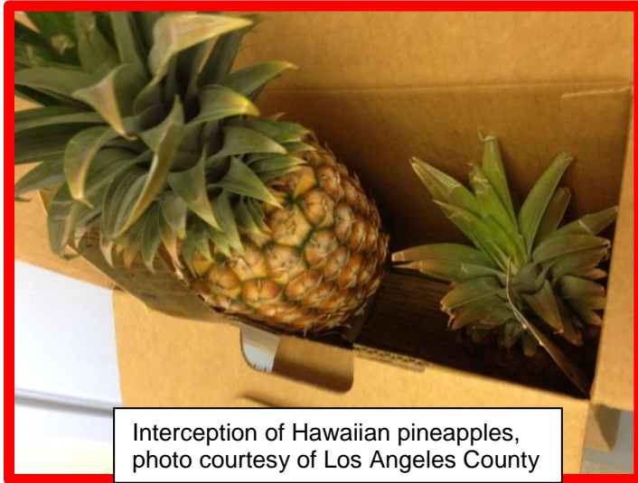
Interception of Hawaiian pineapples

A notice of rejection was issued for violation of California FAC Section 6461.5 and the pineapples were destroyed by freezing.