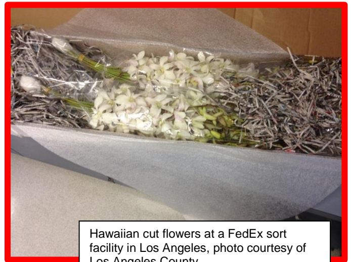
Hawaiian cut flowers at a FedEx sort facility in Los Angeles, photo courtesy of Los Angeles County

A notice of rejection was issued for violation of California Food and Agricultural Code (FAC) Section 6461.5 (live pests). The shipment of cut flowers were destroyed by freezing.