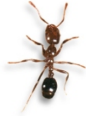
Image of Red Imported fire ant

On October 4, 2014, a commercial truck shipment of nursery stock from Florida arrived at the Blythe Border Protection Station. Supervisor Gilbert Canchola processed the paperwork that included all proper certification. Supervisor Rosie Villa, who assisted in the physical inspection of the load, looked in the back entrance on the bed of the trailer and intercepted two live ant pests. Supervisor Villa proceeded to take images of the specimen using the station's digital imaging microscope. Images were emailed to the PPD Laboratory for tentative identification. An ensuing notice of rejection was issued for the nursery shipment, in violation of California FAC Section 6461.5 (live pests).