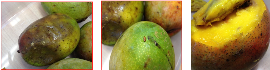
Mango and Avocado

During inspection, suspect fruit fly exit holes were noted on one of the mangos and fly pupae were found in the bottom of the box. When cut open, the fruit produced dozens of fly larvae of various life stages. Dr. Martin Hauser of the Plant Pest Diagnostics (PPD) Laboratory determined the larvae to be Q-rated Tephritidae (fruit fly) and forwarded the larvae for more specific identification for molecular testing which resulted in A-rated Anastrepha obliqua (Caribbean fruit fly). Q-rated Diaspididae (scale) was also intercepted.