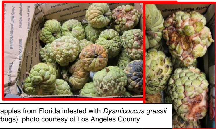
Sugar apples from Florida infested with Dysmicoccus grassii (mealybugs), photo courtesy of Los Angeles County

Pest samples were submitted to the PPD Laboratory and identified as A-rated Dysmicoccus grassii (mealybugs).