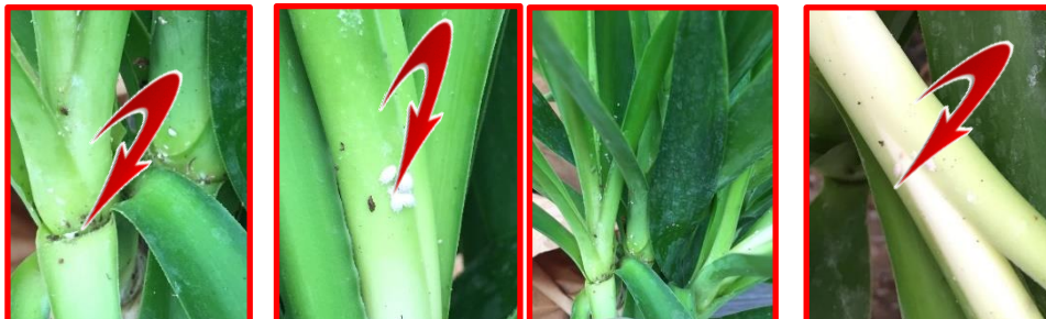
Yucca plants from Florida infested with gray pineapple mealybug

A notice of rejection was issued for violation of California FAC Section 6461.5 (live pests). Infested plants in the shipment were destroyed and the rest of the plants were inspected and released.