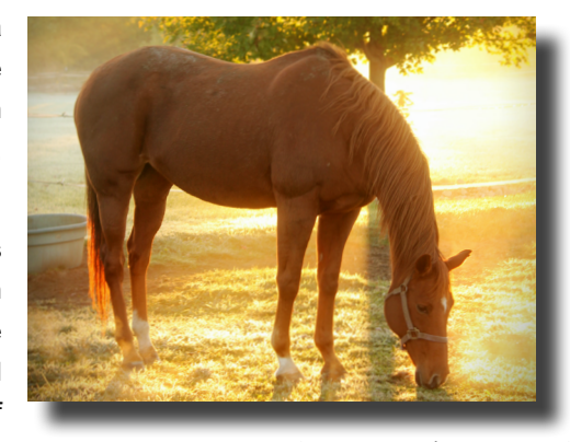
(Continued on page 4)

West Nile Virus is the leading cause of arthropod-borne encephalitis (brain inflammation) in horses and humans in the United States, with horses representing 96.9% of all non-human mammalian cases. The virus is present in all 48 continental states, Mexico, and Canada, and is transmitted from avian reservoir hosts to mammals by a variety of