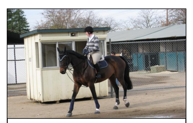
During a disease outbreak, it may be necessary to set up check points at barn entry and exit points to stop horse and riders before proceeding.

During an infectious disease outbreak, it is essential for event management to know what horses are on the event premises and where they are stabled. For events without a check-in gate or admittance protocols, locating horses may require barn to barn inspection and documentation. If a disease outbreak warrants movement controls, a check-out protocol is necessary for all horses being moved from the premises. In some cases, event staff may require owner/agents to obtain approval before horses are moved from the event premises. A basic check-out