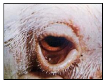
Conjunctivitis and edema of the eyelids

To report an unusual number of sick or dead birds, call: Sick Bird Hotline (866) 922-2473