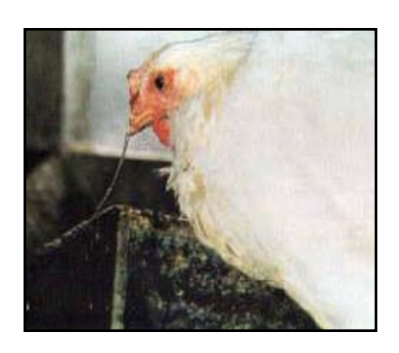
Excessive fluids are commonly seen in the respiratory tract