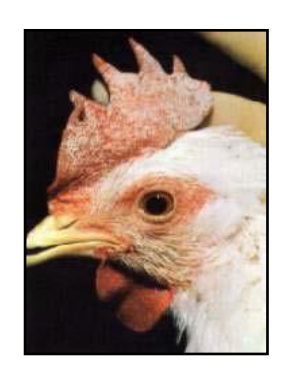
Normal appearing chicken with a pale comb