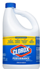
Clorox Regular Bleach®