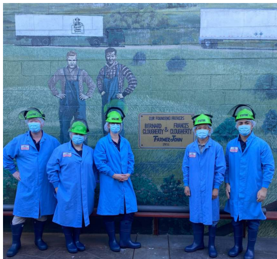
CDFA Animal Care Program team members on their tour of Smithfield processing plant in Vernon, CA. The Smithfield plant practices tracing and segregation of live hogs and pork meat.

Each of the sow farms I visited was dedicated exclusively to making Prop 12-compliant pork. None were “split operations,” raising both compliant and noncompliant sows at the same site. “Pig flow,” or the need to trace and segregate product throughout the supply chain, was the main justification offered by the farmers for not splitting up operations at a single farming site. To market pork as Prop 12-compliant, producers must be able to trace each cut of meat sold in California back to the sow farm. While there are a variety of ways to accomplish the goal of tracking and tracing compliant hogs, all of the producers I visited said it was easiest to have one planned line of compliant pig movement—meaning all the piglets from a specific sow farm go to a specific weaning farm, and then all those pigs go to the same