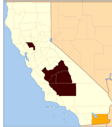
Figure 2: Location of the five leading hard red winter wheat (brown) and durum wheat (orange) producing counties in California [6] .

The importance of durum wheat has increased since the 1970s. With an average area of some 100,000 acres during the last decade, durum wheat is now produced on 20 to 25% of the wheat area in California [7] .