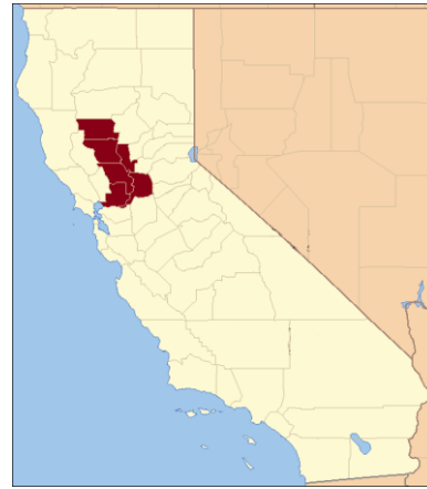
Figure 2: Top sunflower-producing counties in California according to 2012 USDA census data [10] .

Sunflowers are grown under both irrigated and dryland conditions. In 2012, about 60% of the reported acreage in California was irrigated; in Yolo County, about 75% of the acreage was irrigated. Historically this has been furrow irrigation. However, drip irrigation has become more common since processing tomatoes, with which sunflowers are often rotated, are now largely drip-irrigated [8] . Seed for both oil- and non-oil sunflower types are produced. However, the proportion of non-oil types declined steeply as overall acreage has risen: at the 2002 census almost 40% of sunflower acreage was non-oil types, while at the 2012 census it was only 5-10% [10] .