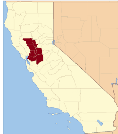
Figure 2: Top safflower-producing counties in California according to 2012 census data [5] .

California is the largest safflower producer in the US, in 2012 accounting for about 40% of national safflower acreage. Montana and Idaho also have significant acreages [5] .