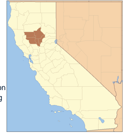
Figure 2: Location of the five leading rice producing counties in California [3].

In the Sacramento Valley, rice is grown on soils with a high clay content or a restrictive layer, which reduce water infiltration. These soils are ideal for rice production, but less favorable for other crops. Rice production in the San Joaquin Valley is small mainly because crops which return a higher income per acre can be grown on the more fertile soils there. In addition, the water supply is more restricted in the San Joaquin Valley compared to the Sacramento Valley [5].