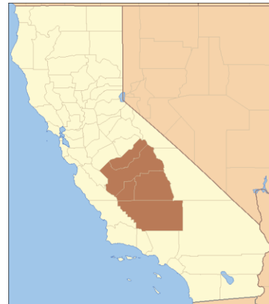
Figure 3: Location of the five leading pistachio producing counties in California [7] .

More than 98% of all pistachios produced in the U.S. are grown in California, with most of the remainder being harvested in New Mexico and Arizona [7] . California pistachios are predominantly grown in the southern San Joaquin Valley (Figure 3), with the five leading counties, namely Kern, Madera, Fresno, Kings and Tulare, accounting for 96% of the production. Kern county alone accounted for 42% of the production in 2012 [7] . In 2012, about 25% of the world's pistachios were produced in California, making the U.S. the second largest pistachio producer behind Iran, where roughly half of the world's pistachios were harvested [3, 7] .