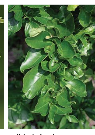
Whwn psyllids feed on citrus leaves, the leaves become distorted and malformed. Psyllids extract large amounts of sap from trees and produce honeydew, which can cause sooty mold.

The state of California has strict regulations in place to ensure that citrus trees are produced with pathogen-tested propagative material. However, the general public does not always understand the importance of these regulations, and people sometimes unknowingly bring diseased plant material into California and graft their own trees. The UC Citrus Clonal Protection