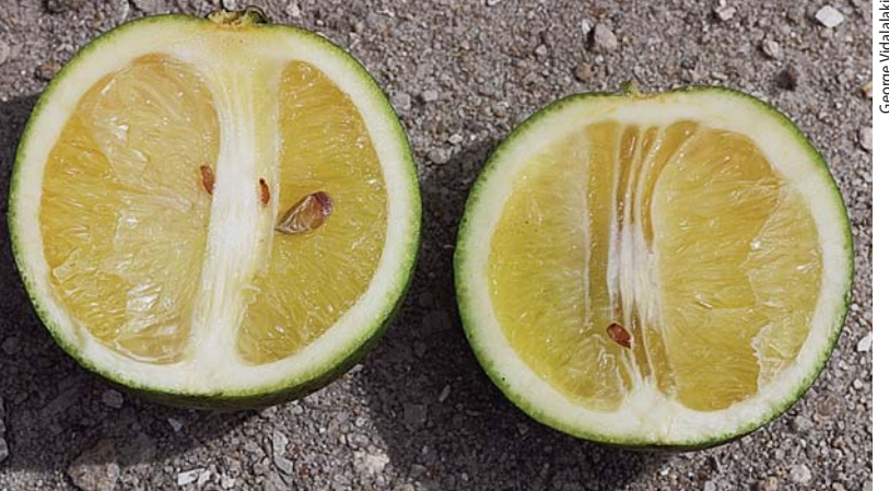
Leaves with huanglong bing symptoms, top. Note the yellow areas to one side of the midveins and the dark green areas directly opposite. Citrus trees with the disease often have, top inset, excessive and premature fruit drop, or, above, citrus fruits that are small, hard and misshapen or have rinds that do not color properly. Such symptoms may not show up in the tree for a year or more after infection. Research is under way to detect the disease earlier so that infected trees can be removed.