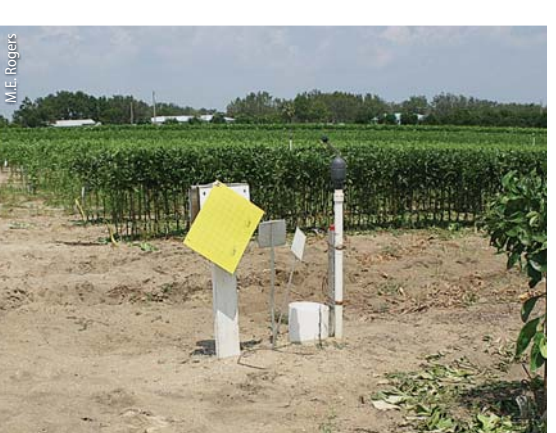
In addition to careful visual monitoring for all stages of Asian citrus psyllid, yellow sticky cards can be used to detect adults.