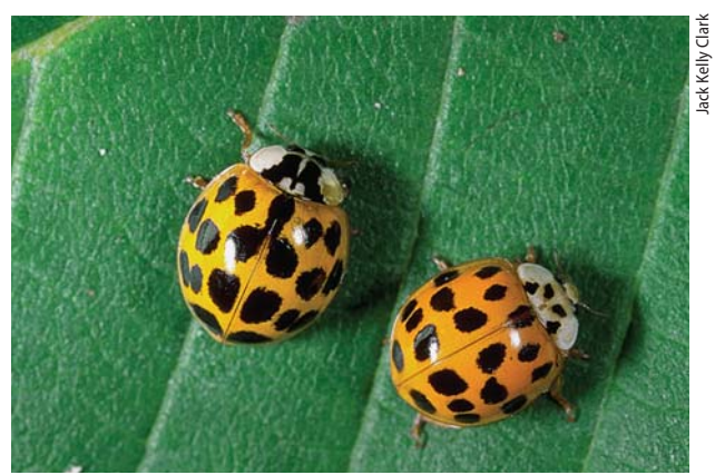
Left, psyllid nymphs produce waxy tubules. Two biological controls that target the nymphs have shown promise in Florida. Center, the parasitic Tamarixa radiata (Waterson) wasp, from Taiwan and Vietnam, lays eggs underneath the nymph, and the wasp larvae will feed on and kill the psyllid. Right, lady beetles, Harmonia axyridis Pallas, feed on psyllid nymphs.