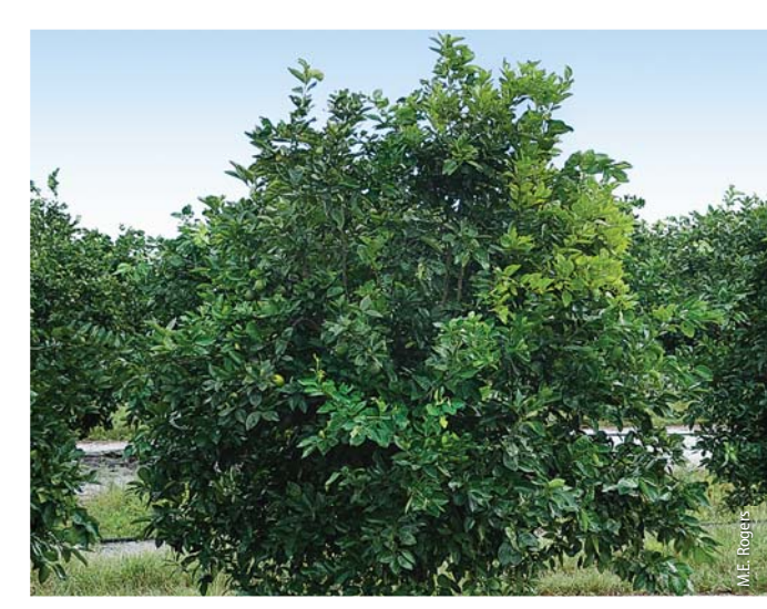
Asian citrus psyllid carries the vector of huanglongbing disease, also known as citrus greening. One symptom of the disease is mottling and chlorosis of leaves.

giving this serious citrus disease free rein in the Golden State. UC is working with officials from the citrus industry, U.S. Department of Agriculture and California Department of Food and Agriculture (CDFA) to wage an all-out battle.