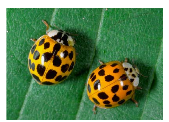
Figure 23. Harmonia axyridis coccinellid predatory beetles.