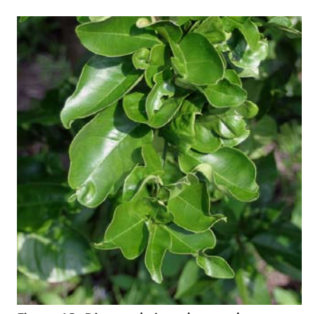
Figure 13. Distorted citrus leaves due to previous psyllid feeding.