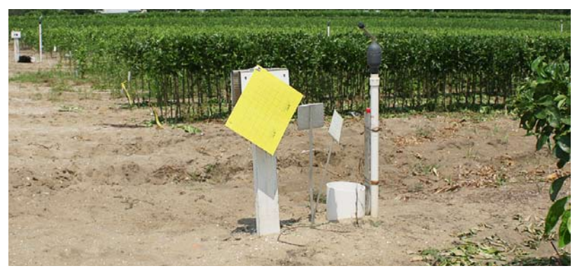
Figure 22. Yellow sticky card for adult psyllid detection.