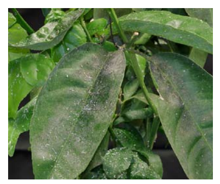
Figure 9. Sooty mold growing on the honeydew excreted by the nymphs.