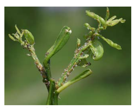
Figure 12. Malformed citrus leaves due to psyllid feeding.