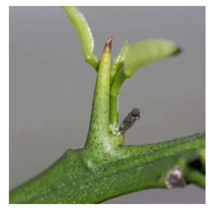
Figure18. The characteristic body tilt of the adult citrus psyllid.