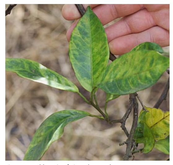
Figure 15. Chlorosis of citrus leaves due to greening caused by L. asiaticus.