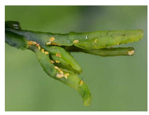
Figure 19. Psyllid eggs and nymphs tucked into crevices and folds.