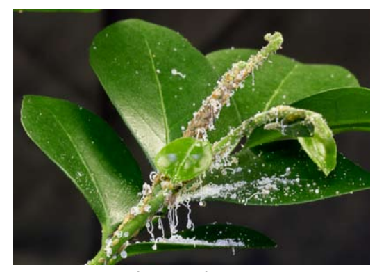
Figure 21. Heavy infestation of psyllids on Murraya .