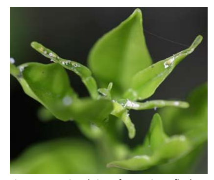
Figure 10. Twisted tips of new citrus flush due to psyllid feeding.

In addition, as Asian citrus psyllid feeds, it injects a salivary toxin that stops terminal elongation and causes malformation of leaves and shoots (fig. 10) (Michaud 2004). A single psyllid nymph feeding for less than 24 hours on a citrus leaf causes permanent malformation of that leaf. Overwintering adults aggregate on newly forming citrus leaf buds where they feed and mate. Often, initial infestations of Asian citrus psyllids are highly aggregated on individual trees within citrus orchards. This aggregation and feeding causes distortion of the leaf buds that provides improved oviposition sites. Citrus flush is often severely damaged (figs. 11 and 12), resulting in the abscission of the leaves and shoots (Halbert and Manjunath 2004) or malformed mature leaves (fig. 13). Mature trees can tolerate this damage since the loss of leaves or shoots is only a small portion of the total tree canopy. Nursery trees and new plantings may require chemical protection.