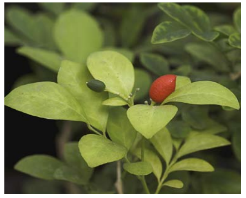
Figure 3. Murraya paniculata, orange jasmine.