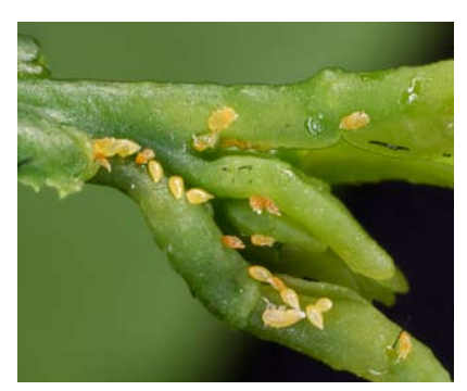
Figure 6. Psyllid eggs and hatching nymphs.