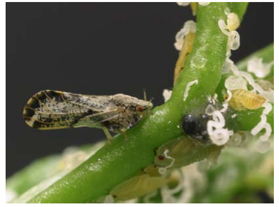
Figure 1. Asian citrus psyllid adult and nymphs.

Asian citrus psyllid is found in tropical and subtropical Asia, Afghanistan, Saudi Arabia, Reunion, Mauritius, parts of South and Central America, Mexico, and the Caribbean (fig. 2). In the United States, Asian citrus psyllid was first found in Palm Beach County, Florida, in June 1998 in backyard plantings of Murraya paniculata (orange jasmine) (fig. 3). By 2001, it had spread to 31 counties in Florida, with much of the spread due to movement of infested nursery plants (Halbert et al. 2002). In the spring of 2001, Asian citrus psyllid was accidentally introduced into the Rio Grande