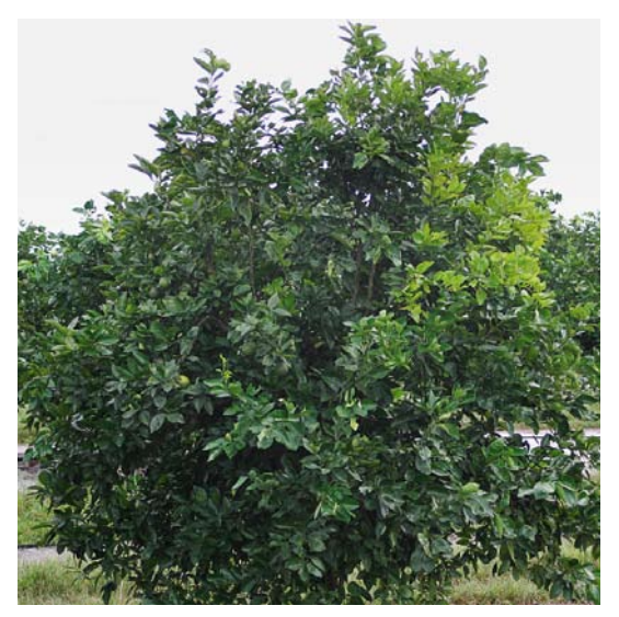
Figure 14. Yellowing of a quadrant of a citrus tree due to greening.