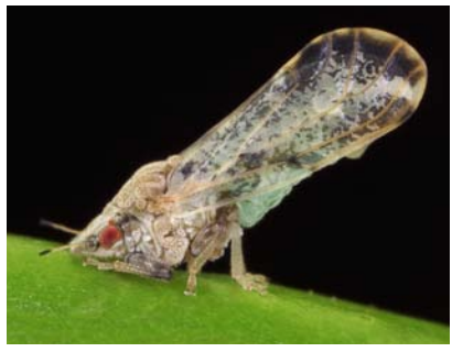
Figure 5. Psyllid adult feeding.

Figure 4. Life cycle of Asian citrus psyllid. Illustration by G. O. Conville after Catling 1970.