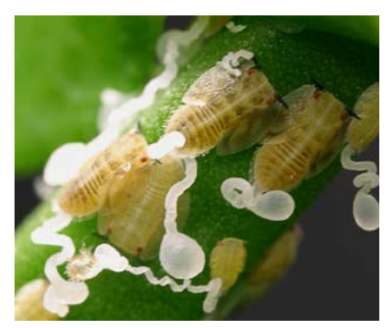
Figure 8. Waxy tubules produced by nymphs.

Asian citrus psyllid females lay their bright yellow-orange, almond-shaped eggs on the tips of growing shoots or in the crevices of unfolded "feather flush" leaves (fig. 6). The number of eggs laid is dependent upon host plant. For example, a mean of 857 eggs per female was deposited on grapefruit, whereas a mean of 572 eggs per female was deposited on rough lemon. At 77°F (25°C), the eggs hatch in about 4 days (Tsai and Liu 2000).