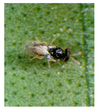
Figure 24. Tamarixia radiata parasitic wasp.