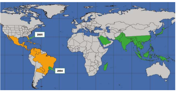
Figure 2. Worldwide distribution of Asian citrus psyllid alone (orange) and the psyllid in combination with the Asian form of greening disease (green). Illustration by G. H. Montez.

Valley of Texas on potted nursery stock (orange jasmine) from Florida (French et al. 2001). The Asian citrus psyllid could invade California at any time, with most likely sources of infestation being Florida, Mexico, or Asia. There were 170 interceptions of Asian citrus psyllid at U.S. ports on plant material (primarily Murraya and citrus) from Asia from 1985 to 2003.