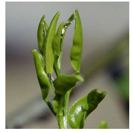
Figure 17. Twisted tips of citrus foliage caused by psyllid feeding.

If you suspect that you have found this psyllid, place the infested plant in a container or place adults and nymphs in alcohol and contact your local county agricultural commissioner's office for identification. If the find is determined to be Asian citrus psyllid, the extent of the infestation will be delineated using visual surveys, and the appropriate regulatory actions will be taken to minimize the spread of Asian citrus psyllid from the site. Regulatory steps may include infested plant destruction, insecticidal treatment of plants around the infestation, quarantine of the area, and additional surveys and treatments of the area during periods of new flush.