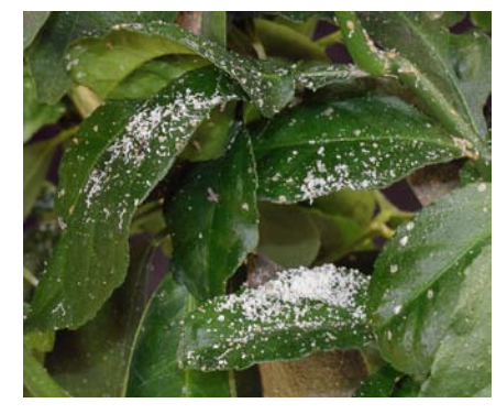
Figure 20. Honeydew, sooty mold, and waxy tubules produced by psyllids.