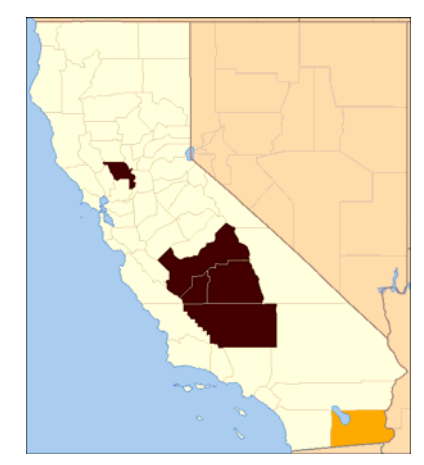
Figure 2: Location of the five leading hard red winter wheat (brown) and durum wheat (orange) producing counties in California <sup>[6]</sup>.

The importance of durum wheat has increased since the 1970s. With an average area of some 100,000 acres during the last decade, durum wheat is now produced on 20 to 25% of the wheat area in California [7].