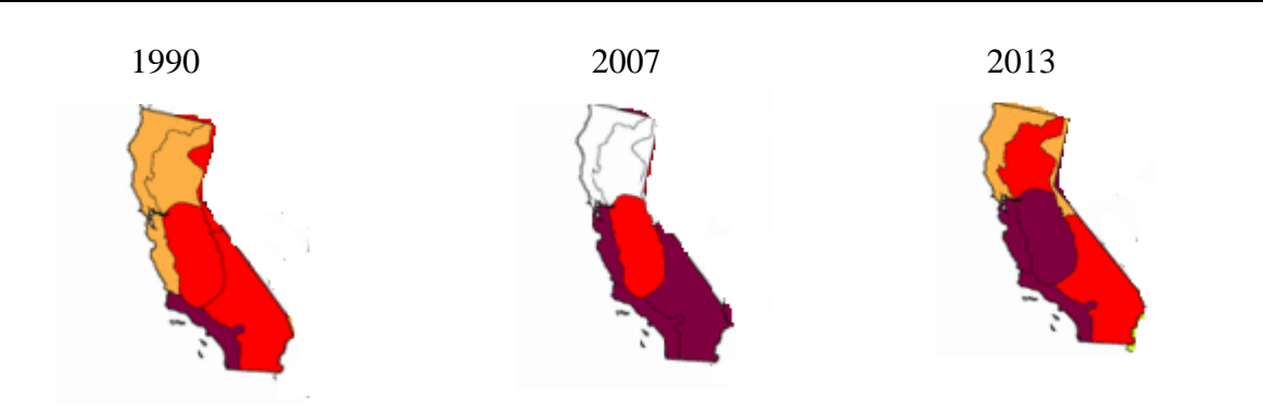
Figure 1. Palmer Modified Drought Index - Recent California Droughts*

Ironically, a number of communities within the SJV, many of which are dependent on employment in the agricultural sector are also among the most food insecure in California and the US, with 33% to 41% of low income residents classified as food insecure.<sup>3</sup> Historic and continuing high levels of unemployment and poverty within SJV communities suggest increased vulnerability should the drought persist.