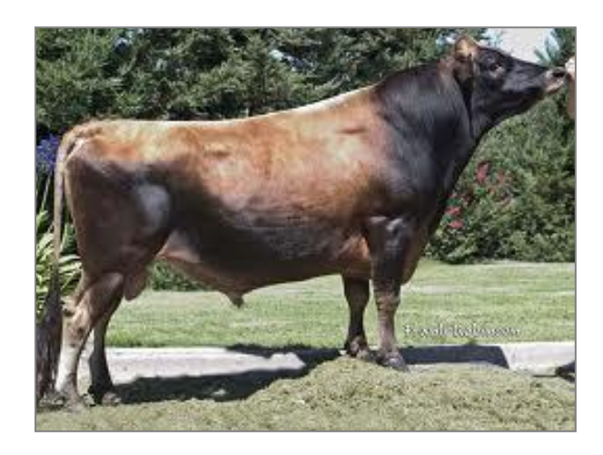
Distinction between Beef and Dairy Cattle (3 CCR §830; FAC 10610)

"Dairy cattle" means all cattle, regardless of age or sex or current use, that are 40 percent or more dairy in breed(s).