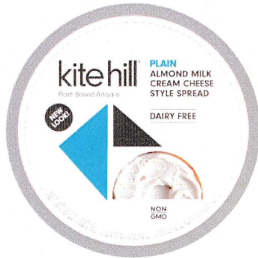
Exhibit A.1: Kite Hill Plain Almond Milk Cream Cheese Style Spread, 8 OZ